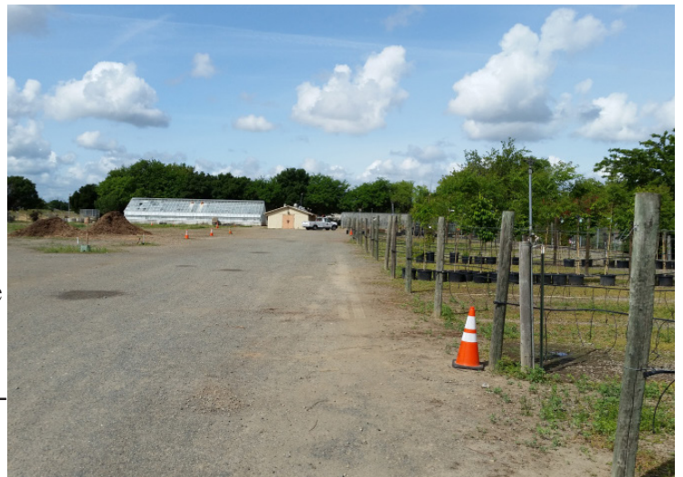
Mangan Park as it stands now.