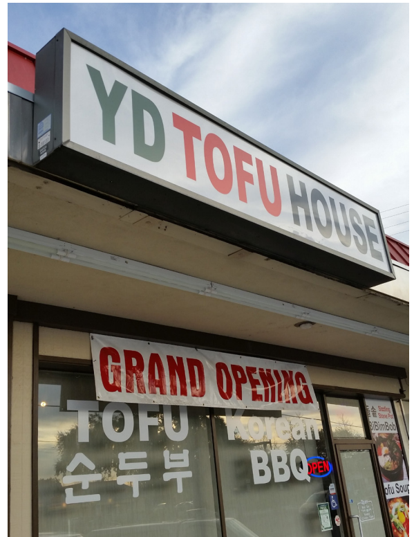
YD Tofu House's entrance on Freeport Boulevard.