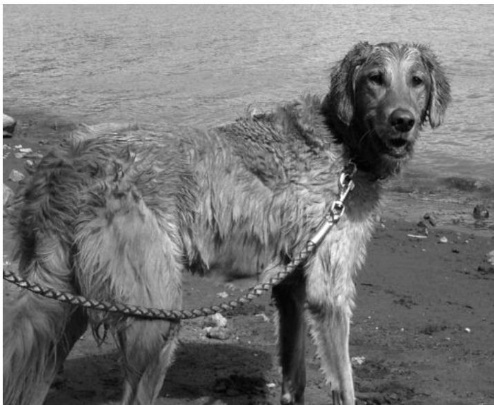
Kinley is a gorgeous Golden girl. Kinley loves camping, hiking and running alongside dad's bike in the wee morning hours!