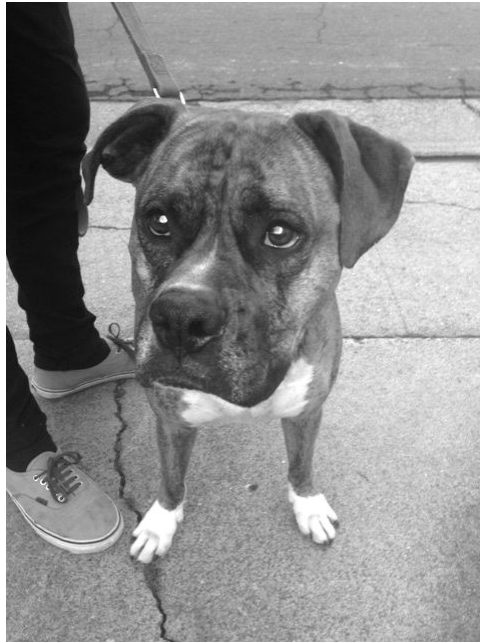
Rosie is a lovely brindle Boxer girl. You will see Rosie walking around Hollywood Park daily with her favorite family!