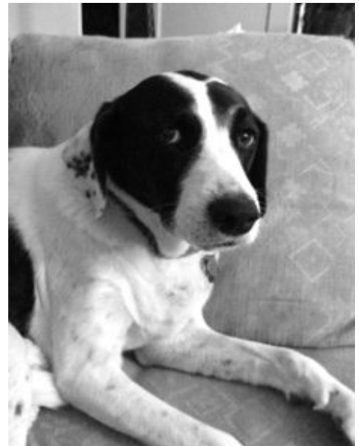
Gracie is a 50lb lap dog! Gracie loves car rides, belly rubs and being cuddled up with mom on the couch!