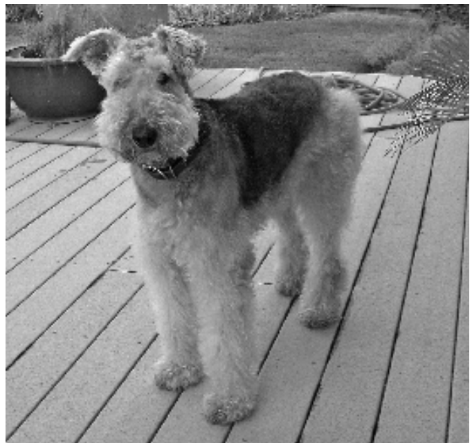
Lulu is a gorgeous Airedale! She is 10 years young and loves her walks through Hollywood Park. Make sure to say hello when you see her! She loves people.