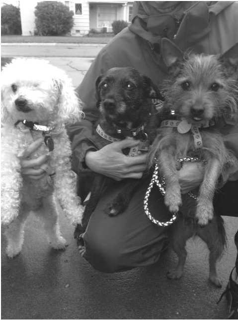
This is Sparky (white), Marley (middle) and Jefe! – This threesome is wild and crazy! They love walks and saying hello to everyone passing by...especially Jefe!

We have a very dog friendly neighborhood. Let's keep it that way! Please remember to pick up after your pooch, ensure their tags and chips are updated with current contact information and always enjoy the love of a dog! We of course love all pets here in Hollywood Park - send in your photos for our next issue to hpna95822@gmail.com .