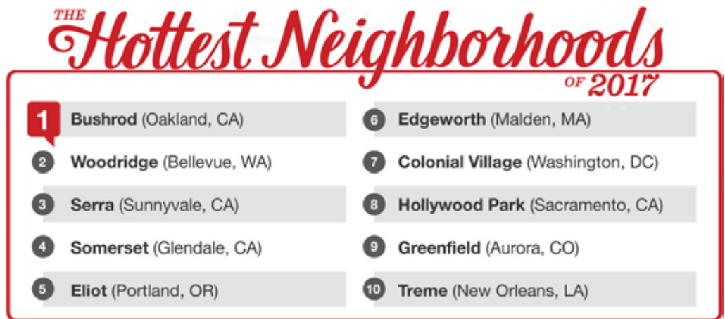
A listing of all 10 “Hottest Neighborhoods” from Redfin.com

A major Real Estate website, Redfin.com, has named Hollywood Park one of the 10 Hottest Neighborhoods in America for 2017. Factors include the close proximity to Downtown, affordability, and the renovated homes that preserve the charm of the area. I’d add great neighbors, excellent schools, and fun activities throughout the year as well!