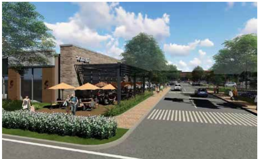
Artists rendering of the new shopping center replacing Capital Nursery.

Progress on the new Raley's shopping center has slowed as a group of residents who border the property have filed a lawsuit to block the development. While the developers and the city are confident that the project will continue, the lawsuit will delay progress until it can be settled or adjudicated.