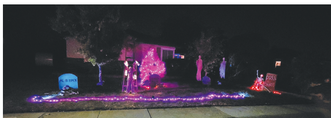
Erlenbusch family on Stover Way