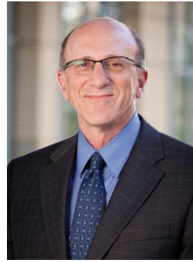
Councilmember Jay Schenirer

From the Office of District 5 City Councilmember Jay Schenirer