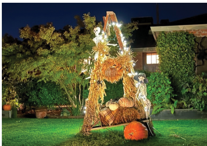
Magee family on 22nd Avenue