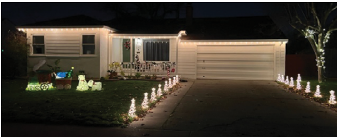
The Loera Family on Hollywood Way

And the winners are, in no particular order: