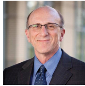
Councilmember Jay Schenirer

From the Office of District 5 City Councilmember Jay Schenirer