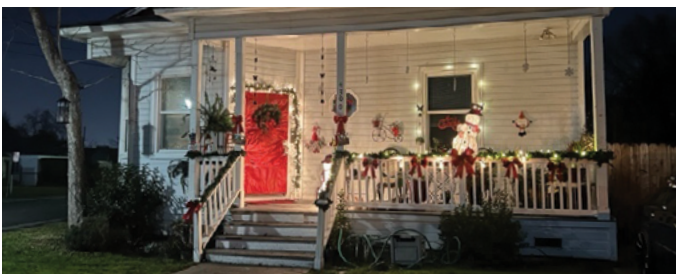
Crystal Pritchett on 23rd Street