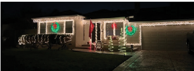
The Hobbs Family on Harte Way