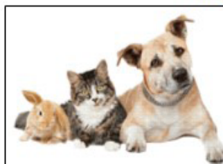
Front Street Animal Shelter