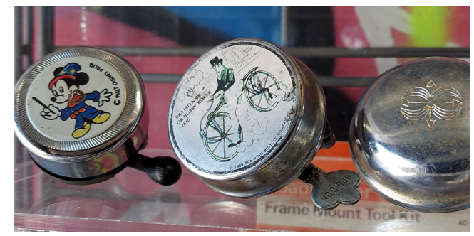
Vintage Bike Bells

If you do a little research on-line, you will find that Sutterville Bicycle Company has a five star review on Yelp and is listed as one of the top 10 bike shops in Sacramento by many sources.