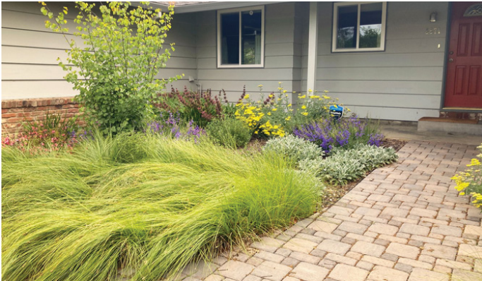
"A bright welcome" to a home designed by Terran Design

(Continued from Page 1) design-build native plant landscaping company, and is a certified Watershed Wise Landscape Professional. She has been developing her knowledge of plants - annuals, perennials, trees, edibles, natives, and ornamentals - for over 15 years. She is the founder and lead designer of Terran Design, a company name inspired by an admiration for the writing of Ursula K. Le Guin.