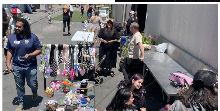
Photos from SummerFest 2025 -- Join this year's party on June 13th!